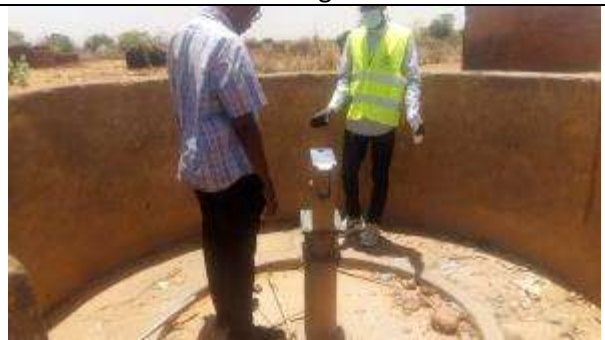
None-Function HP - Kerindang