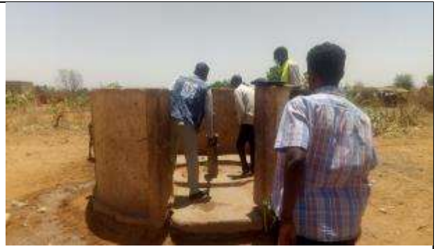
Functioned HP - Kerindang